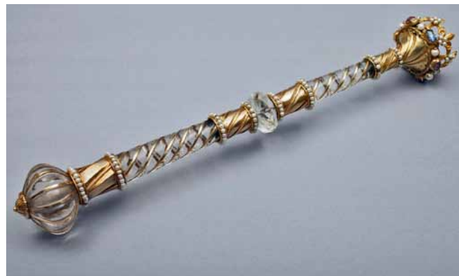
The Crystal Sceptre

I know I tend to bang on about it, but we Arts Scholars are such an interesting bunch. The brief biographies of the new Freeman listed here are a testament to that, but it really came home to me at our admissions ceremony on November 24th at Bakers' Hall. This is the occasion when we officially welcome new members and issue certificates. Once they have sworn their allegiance to the Company and the City of London, each Freeman is asked to say a little more about themselves. What an interesting mix of experience and expertise this reveals. On this occasion we admitted 13 Freeman and 7 Liverymen. Perhaps on future occasions