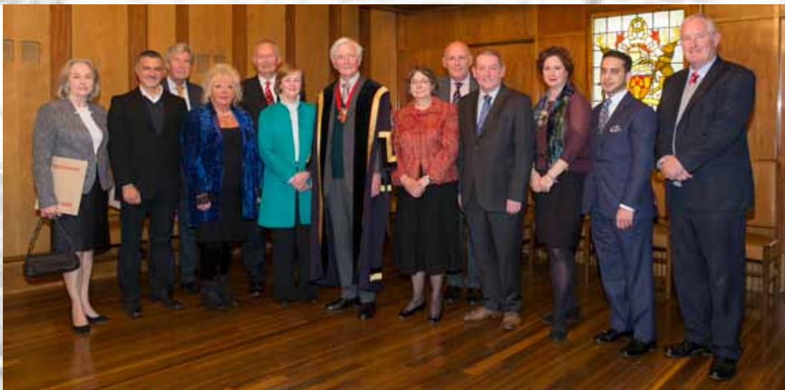
The Master with our new Freemen.