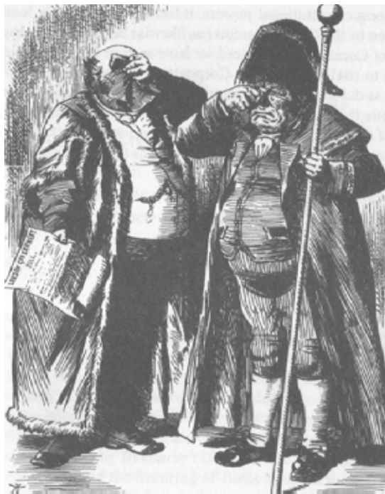
In April 1884 Punch had aldermen and beadles weeping bitterly over the anticipated results of the Royal Commission enquiry into the Livery Companies and the governance of the City of London. The system survived, but the report served as a wake-up call and in the early 21st century the Livery movement is thriving as never before.