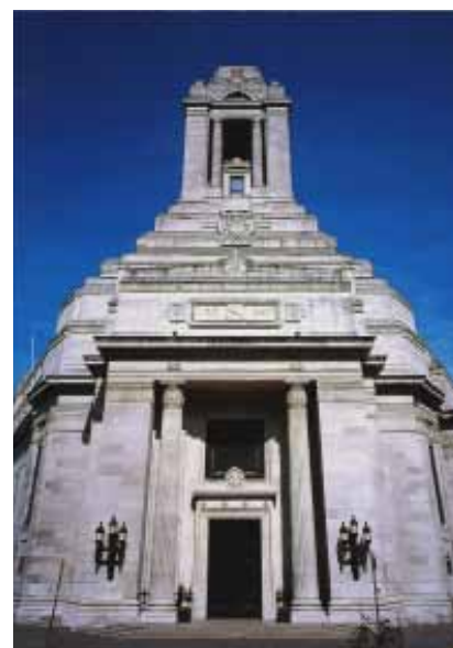
Freemasons' Hall, Great Queen Street

Thanks once again to the generous support of art insurers Berkeley Asset Protection, we will be able to provide this evening for a modest charge of £15 per head. Further details and a booking form will be available in the new year.