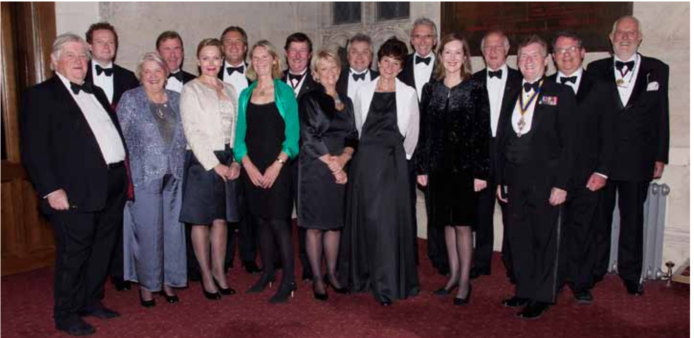
Arts Scholars celebrating Agincourt600 at the Guildhall.